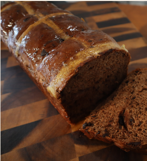
Hot Cross Loaf

Cute treats to gourmet gifts homemade with love to delight everyone