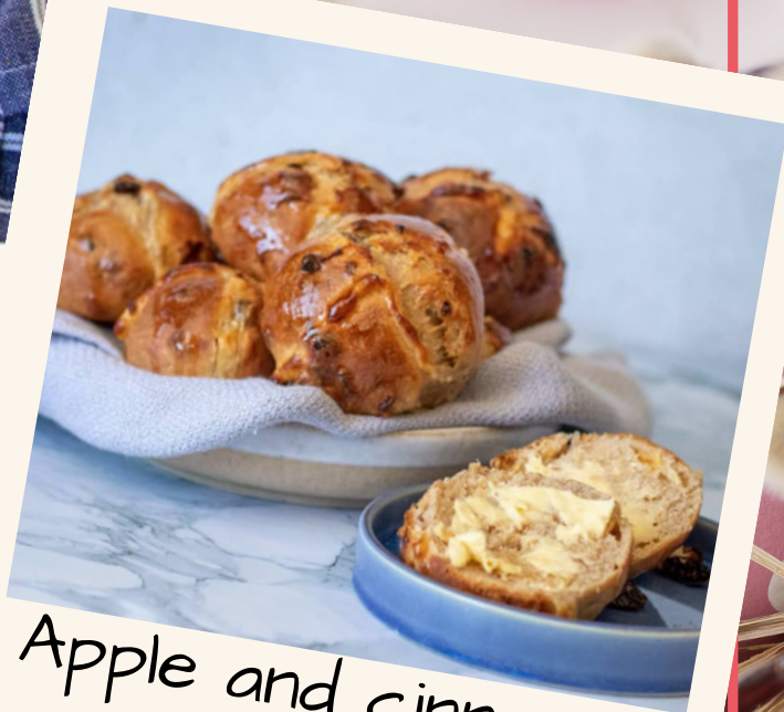
Apple and cinnamon