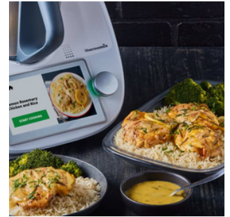
Lemon Rosemary Chicken and Rice