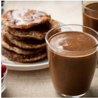
Chocolate Coconut Avocado Smoothie