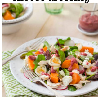
Shredded chicken and sweet potato salad with cranberry dressing