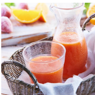
Mango, Orange and Strawberry Juice