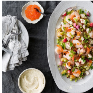
Prawn salad with horseradish cream