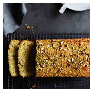
Zucchini pistachio loaf