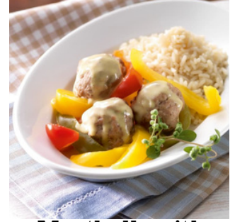
Meatballs with Rice, Peppers and Curry Sauce