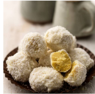
Turmeric and Coconut Bites