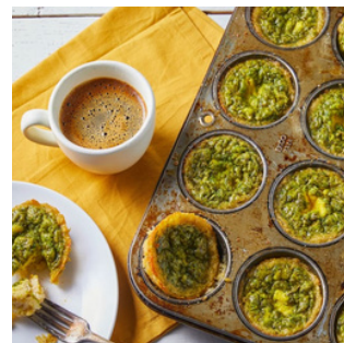
Hash Brown Cups