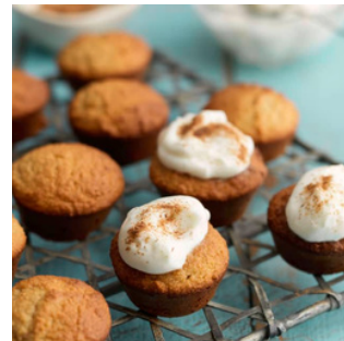
Simple Paleo Cupcake