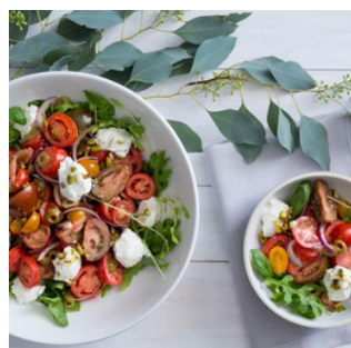
Mixed tomato and labne salad