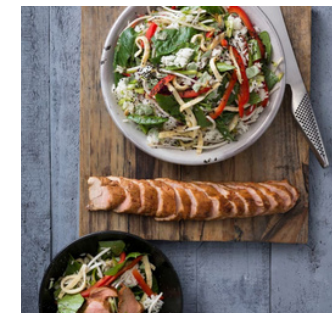
Korean barbecue pork with rice salad

Supporting you to get the most from your Thermomix